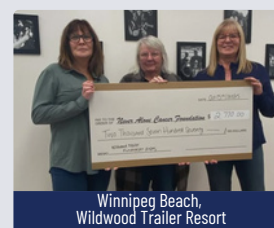
Winnipeg Beach, Wildwood Trailer Resort