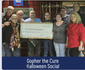
Gopher the Cure Halloween Social