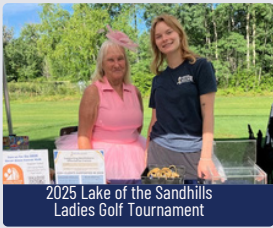
2025 Lake of the Sandhills Ladies Golf Tournament