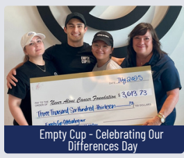
Empty Cup - Celebrating Our Differences Day