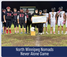
North Winnipeg Nomads Never Alone Game